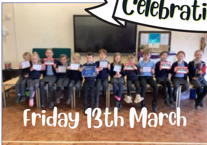
Friday 13th March