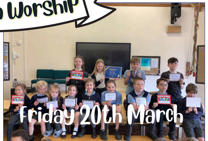
Friday 20th March